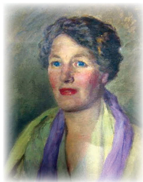
Margaret Sutherland in the 1950s