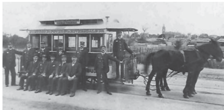
The Hawthorn Tramways Trust’s horse tram in Riversdale Road - the Auburn Tower visible on skyline. Photo undated, but likely between 1889 & 1916